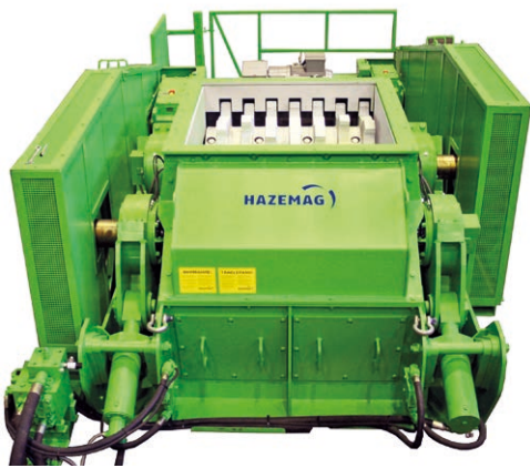
HAZEMAG Roll Crusher | HRC

The crushing rolls for primary and secondary crushers are made up of a roll body in polygon design which is equipped with exchangeable crushing segments. As a result of the specific geometry between roll body and crushing segment an optimum tight fit is achieved, thus being able to stand up to the high crushing forces. Depending on the respective task definition, the shape of teeth and their number are selected.